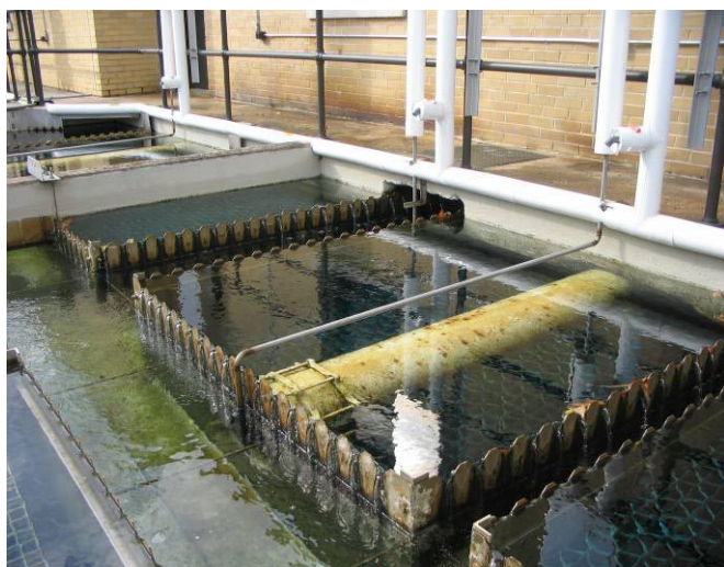
No Ultrasound - December 2006