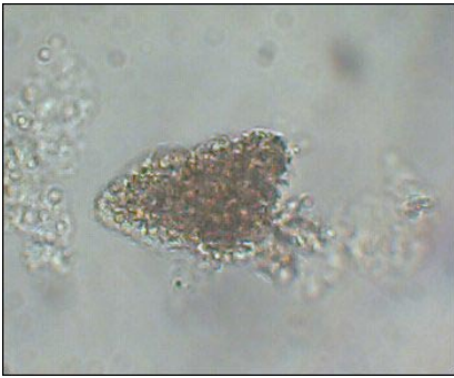
Microcystis: Shaken on left. 2 hours later on right. Recovered from pool filter backwash. Sample is three weeks old. LG Sonic treated.