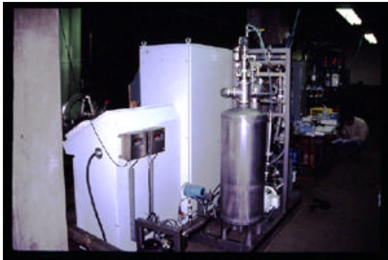
Photograph 2. Back view of Osmonics Model PS 150 Ozone System on location at the University of Minnesota St. Anthony Falls Hydraulic Laboratory.