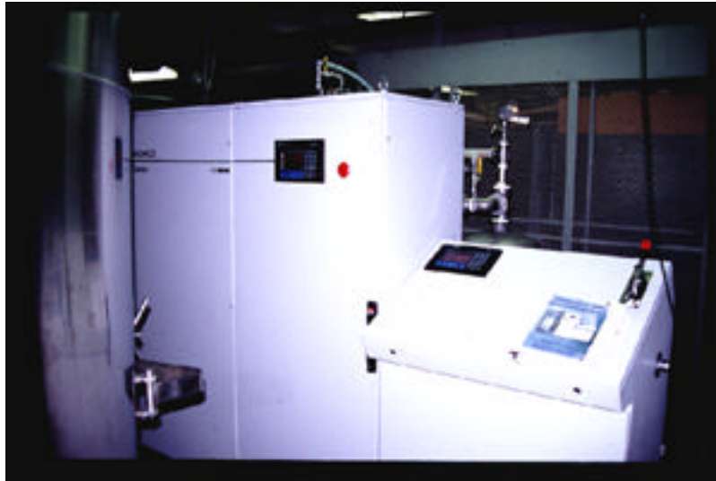
Photograph 1. Front view of Osmonics Model PS 150 Ozone System on location at the University of Minnesota St. Anthony Falls Hydraulic Laboratory.